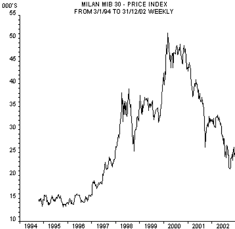
Fig. 2 The Milan Stock Exchange Index MIB30: weekly quotations in the years 1994–2002

models. In this section we only summarize and comment the main figures out of the huge amount of computational results we obtained.